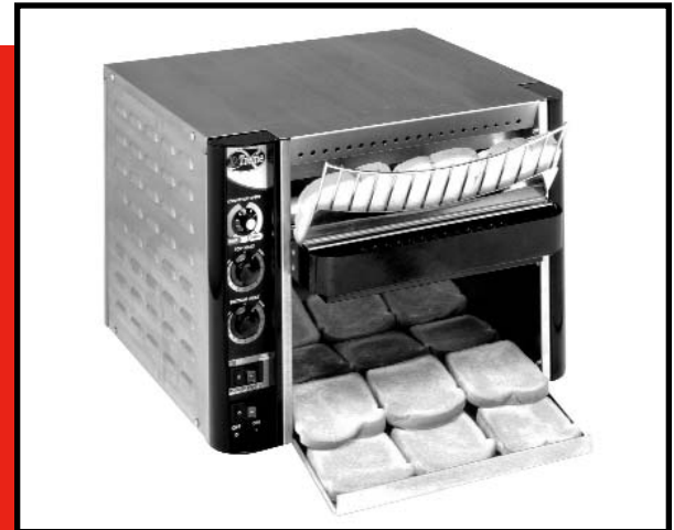
X*TREME-3™ RADIANT CONVEYOR TOASTER

See reverse side for product specifications.