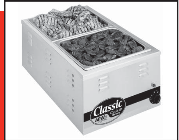
MODEL W-3V COUNTERTOP WARMER