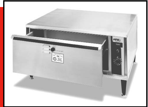
MODEL HDD-1 COUNTERTOP HOLDING DRAWER