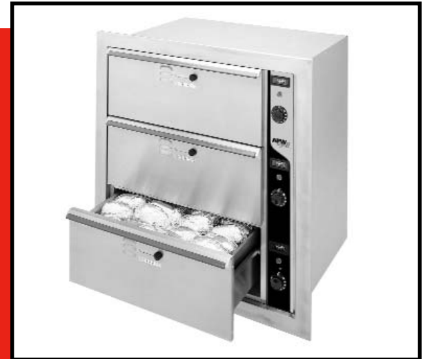
Built-In Holding Drawer