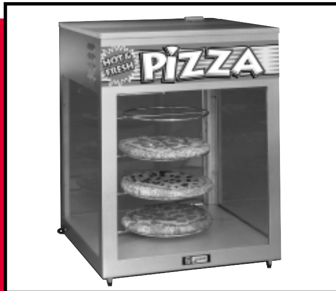
MODEL HDC-4 HEATED DISPLAY CABINET