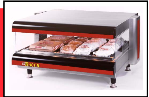
RACER™ Horizontal Open Air Heated Merchandisers